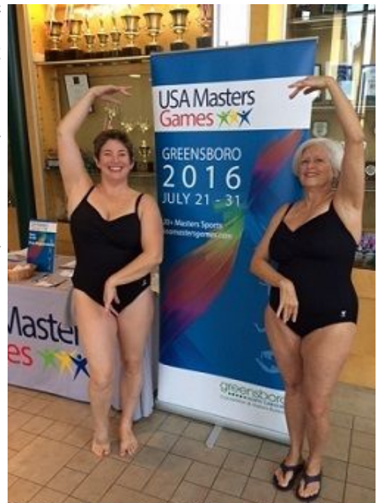
Athletes frame the USA Masters Games banner at Synchro Masters Nationals in Grand Rapids.