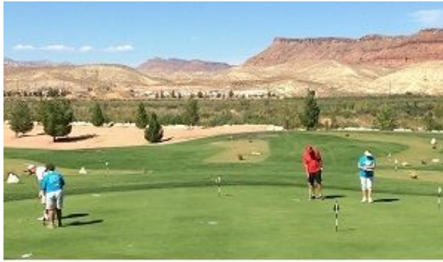
World Senior Games Golf competition in scenic St. George, Utah.